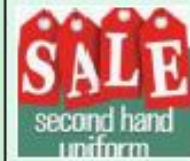
2ND HAND UNIFORMS