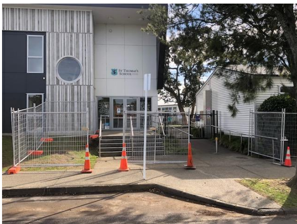
Temporary fencing to school while construction underway at rear of office area.

As we continue to adapt our systems with the move to Covid Level 1, we have had four afternoons where parents were welcome to come onto the school grounds to pick up their children. We have asked parents and children to leave the school grounds by 3:15pm because of increased construction activity currently on site and once construction is complete then the school will reopen after 3:00 for community use. Parents may have noticed the extra construction fence which was recently installed at the front of the school. This is because the builders are working on the walkway which will connect the staffroom to the new block and for safety reasons access to the office area from the netball court area will be closed off. During the school day, staff and students will enter the office area from the front door and the temporary fence is to stop students going out onto the street. Parents will still be able to access the office from Allum Street.